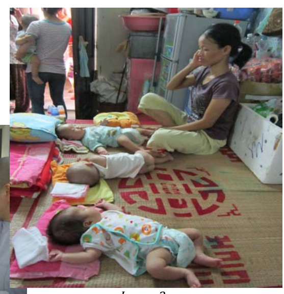
Image 3 Orphan children are raised in Bo De pagoda with nearly 200 other homeless children and elderly,... (Hanoi, Vietnam)

As a matter of fact, in Vietnam, it seems that Buddhist temples undertake all 5 functions as a potential Social Work service centre in Vietnam (service coordination and providing, training – education – communication, community support and development, policy