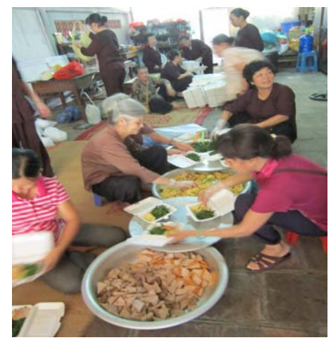
Image 1 Buddhist followers in HoeNhai pagoda (Hanoi, Vietnam) are cooking for poor patients having blood cancers (held every Sunday)